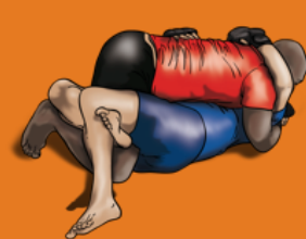
31. HALF-GUARD "ROLL" ESCAPE INTO THE HALF-GUARD