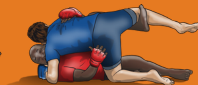
30. KNEE CONTROL ESCAPE WITH THE LEG HOOK