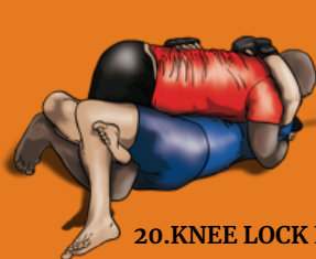
20. KNEE LOCK FROM HALF-GUARD