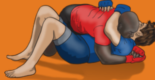
27. BACK MOUNT INTO SIDE CONTROL WITH THE LEG HOOK