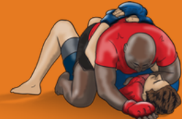
17. WRIST CHOKE FROM MOUNT