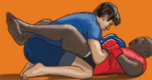
24. BACK MOUNT TO MOUNT