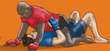
25. TURTLE BACK CONTROL DEFENCE INTO GUARD