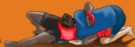
29. NORTH-SOUTH ESCAPE WITH A "RIGHT-LEFT" TWITCH