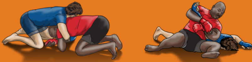
.34.TURTLE HEAD CONTROL SIT-OUT ESCAPE INTO REVERSAL ARM LOCK