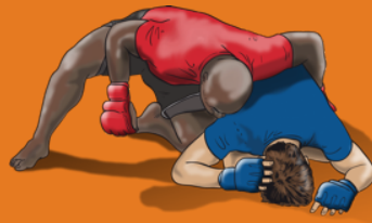
28. BUTTERFLY GUARD INTO TURTLE BACK CONTROL