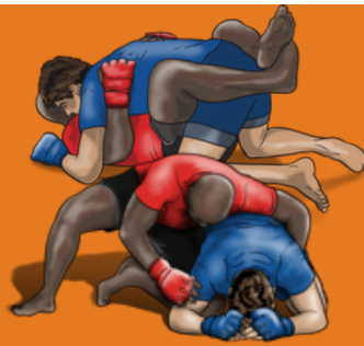
26. TURTLE HEAD CONTROL DEFENCE INTO TURTLE BACK CONTROL