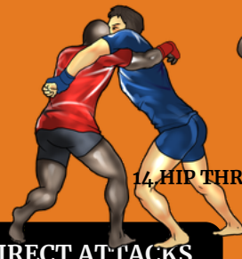
14. HIP THROW FROM SINGLE UNDERHOOK