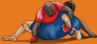
15. KIMURA FROM HALF-GUARD