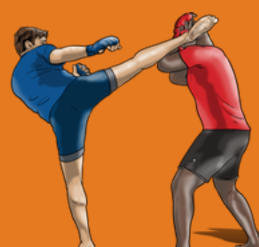
6.HIGH KICK BLOCK