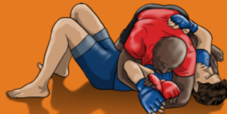
16. AMERICANA FROM SIDE CONTROL