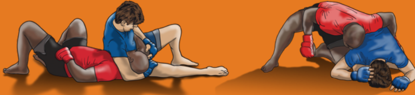
33.SCARF CONTROL ESCAPE INTO TURTLE BACK CONTROL