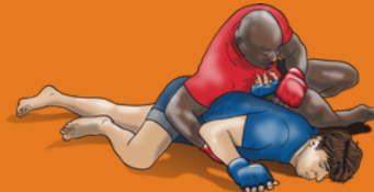
19. ARM LOCK FROM GUARD (OMOPLATA)