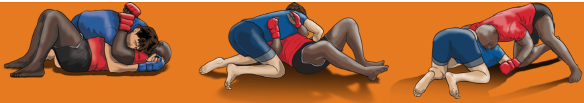
32.SIDE CONTROL "TWIST-OUT" INTO TURTLE HEAD CONTROL