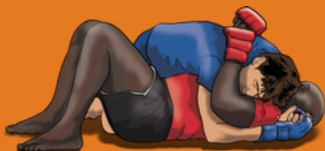
23. SIDE CONTROL DEFENCE INTO HALF-GUARD INTO FULL GUARD INTO BUTTERFLY GUARD