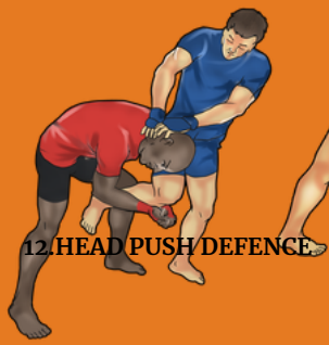
12. HEAD PUSH DEFENCE